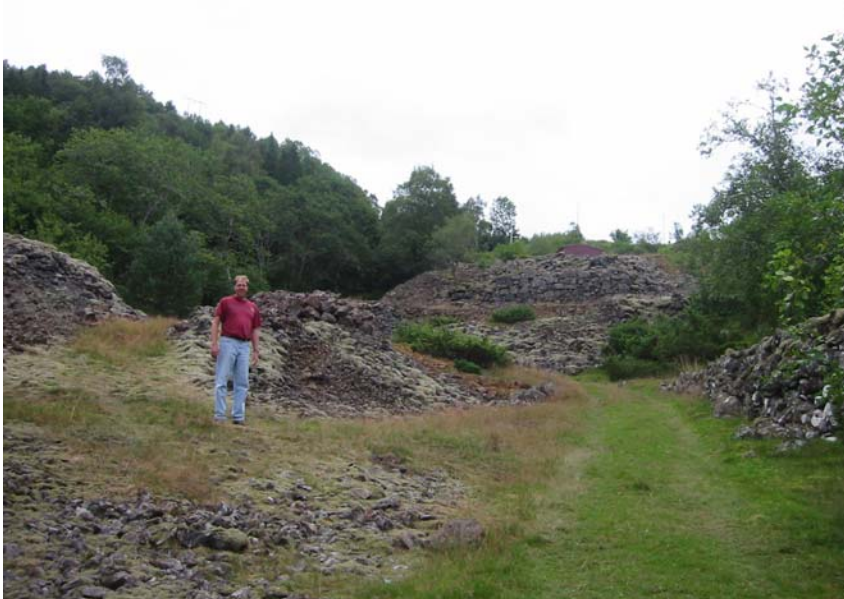
Nonas area waste dumps